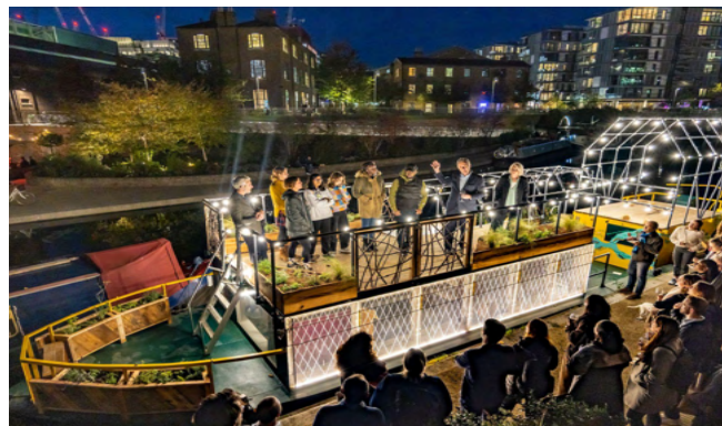
Weekend / After Hours